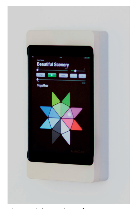
Figure 2. 'The Music Star'.

The colours of the triangles fall into groups of four, with triangles in shades of blue, green, red and grey. Together the first 12 triangles can be seen as one continuum of music stimuli, starting with the least demanding stimuli in the first light blue triangle and increasing gradually to the most demanding stimuli in the last triangle in the red group. Playlists for special use can be assigned to the group of grey triangles at the bottom of 'The Music Star', for instance playlists for use in ambulances or in ECT treatment.