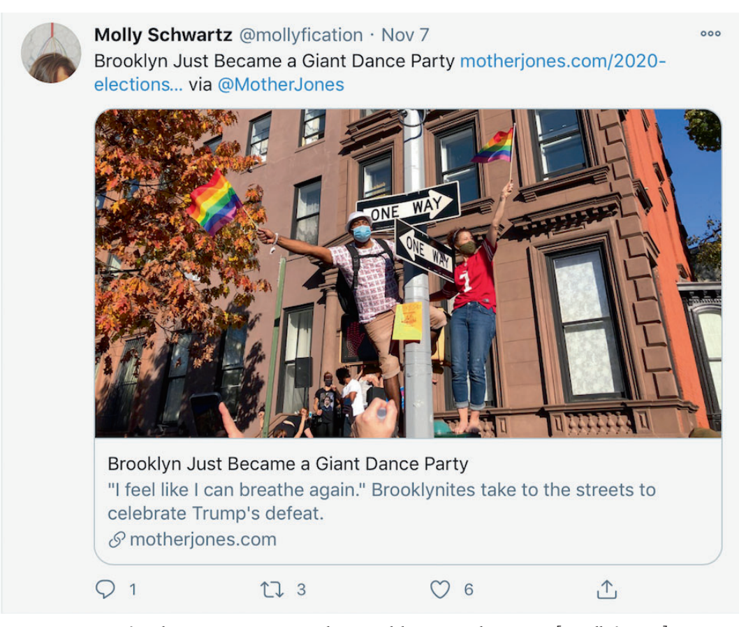
Figure 3: Retweet of Mother Jones story on post-election celebrations. Schwartz, M. [@mollyfication]. (2020, November 7). Brooklyn just became a giant dance party [Retweet]. Twitter. https://twitter.com/mollyfication?lang=en

the chorus of Ludacris' 2009 single "Move B****h" at police officers that had penned it in (Sacher, 2020). A crowd danced the Electric Slide to Public Enemy's "Fight the Power" in front of the White House in Washington, D.C. (Steptoe, 2020). Songs played a role in protest as they were sung, chanted, and played at demonstrations throughout the summer and fall. Videos circulated on the Internet of protestors marching in cities all over the U.S. while singing Brooklyn rapper Pop Smoke's 2019 single "Dior," making it a temporary song of the movement (Wilson, 2020). "Dior" – never intended to be a protest song – speaks with anger about the prison system and was repurposed by fans. Pitchfork Media refers to the song doing "what all great protest songs should: unifying and energizing" (Pierre, 2020). Protests have spontaneously produced grassroots singing of local rappers' songs beyond Smoke. Bay area protestors chanted Mac Dre's "Feeling Myself", and Houston-area protests played rap group Screwed Up Click, which featured Floyd himself. Floyd's verse from "Sittin' on Top of the World" as "Big Floyd" was heard at protests (Chang, 2020), not to mention the profusion of music being recorded that is inspired by the protest movement and