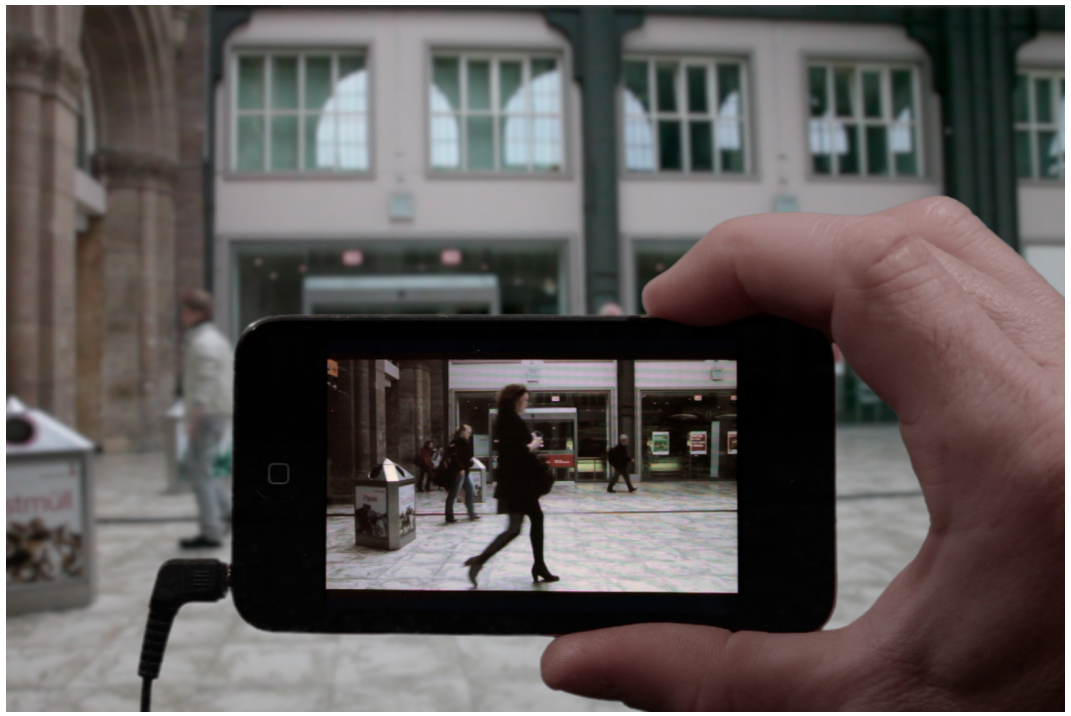
Illustration 7. Alter Bahnhof Video Walk. 2012. Janet Cardiff & George Bures Miller Still frame from representational video walk