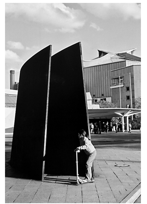
Illustration 3. transit.