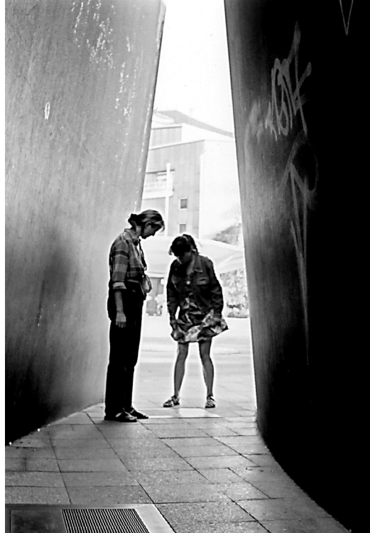
Illustration 4. transition.