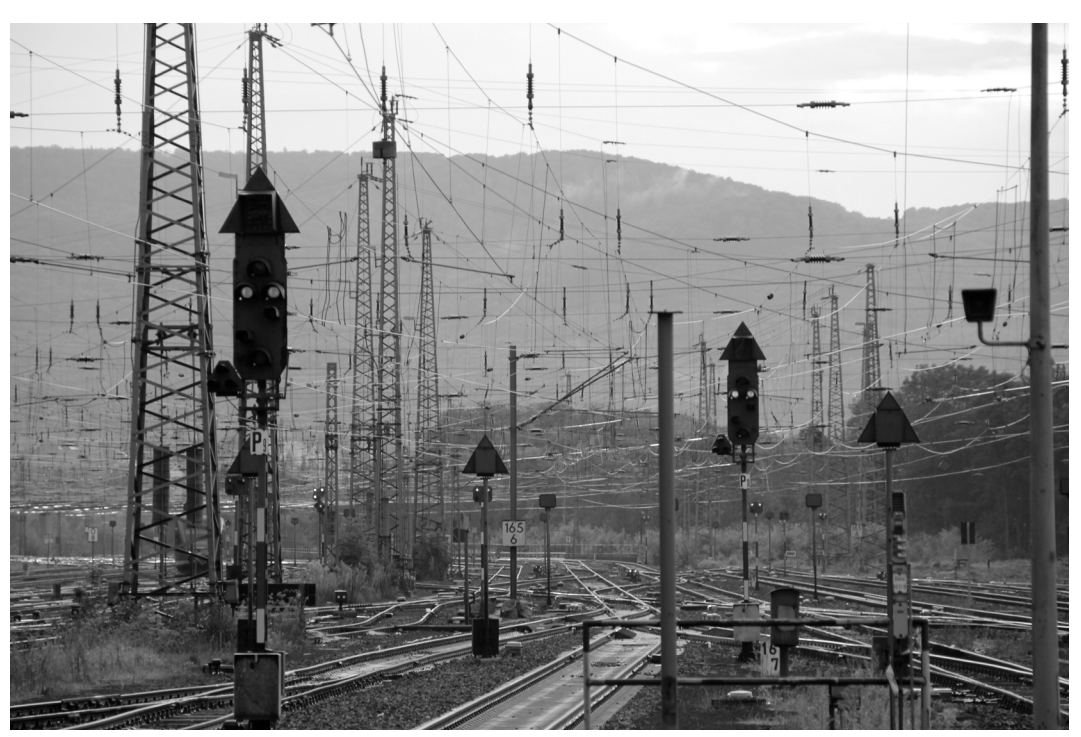
Illustration 2. The trainsstation - Railway_dOKUMENTA in Kassel used a former Railway station as the scenic urban setting for various art works.