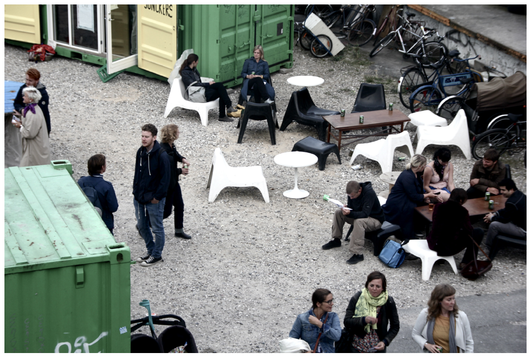
Illustration 1. LAK Festival for Nordic Sound Art takes place in a former lacquer factory in Amager, Cph.