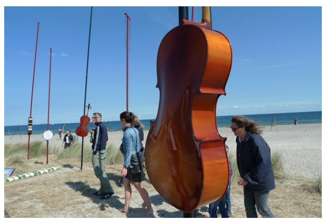
Illustration 6. Harmonic Fields. From the concert hall to urban space.