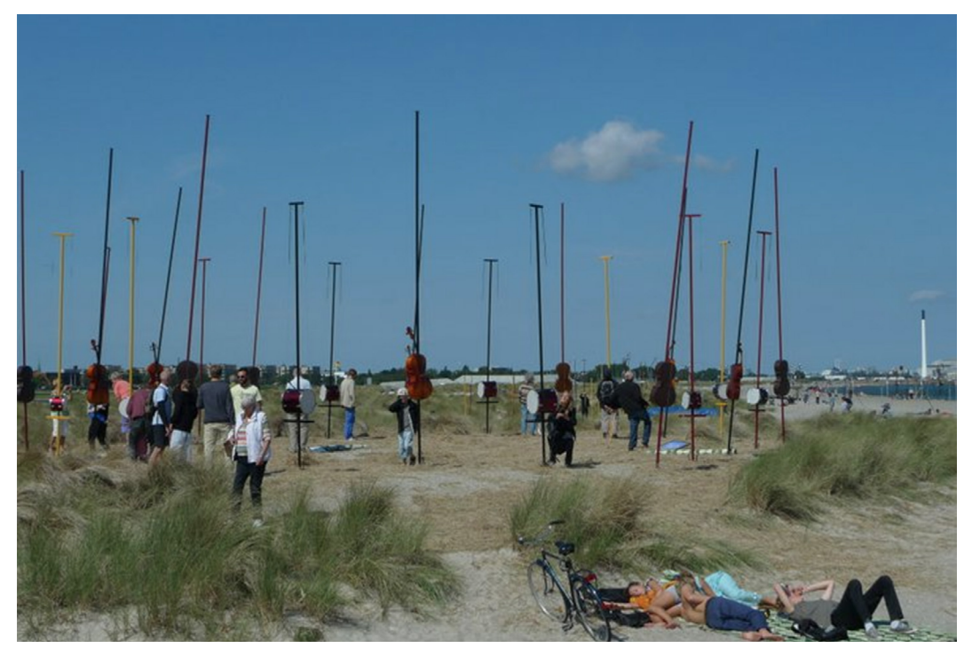
Illustration 5. Harmonic Fields at Amager Strandpark.