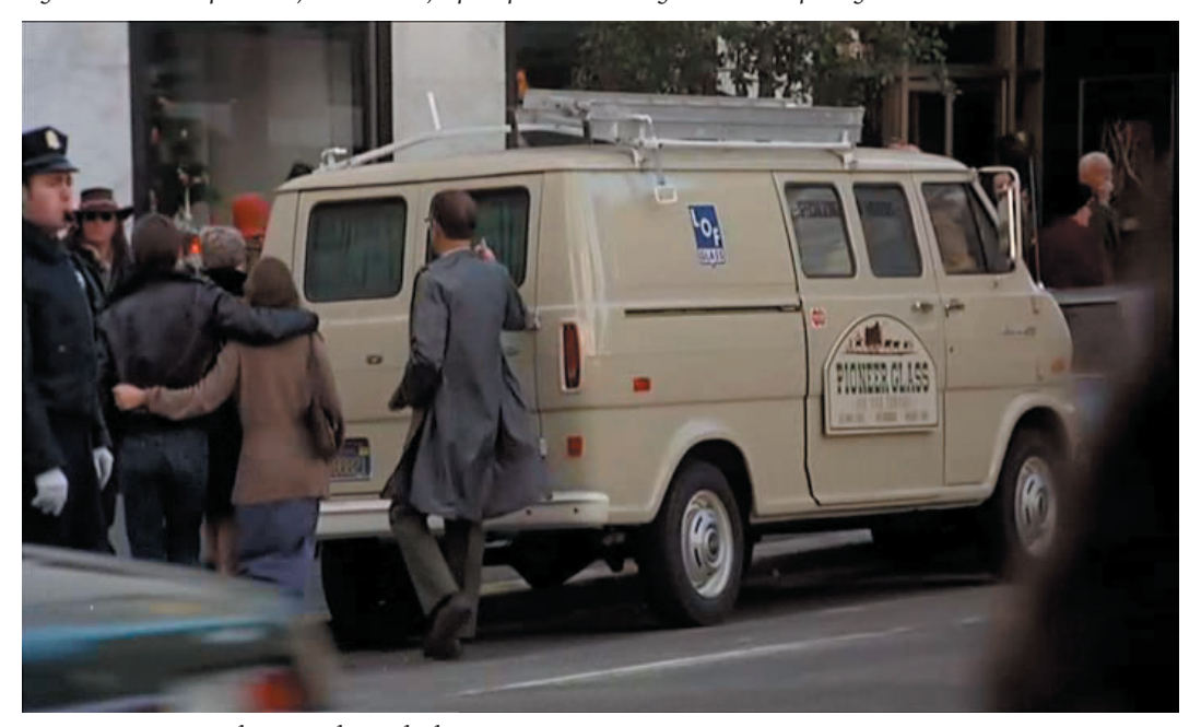
Figure 5 - Harry Caul goes to the parked van

standing of the way sound and image combinations can be set up to deliberately manipulate or obscure the way they will be understood or interpreted.