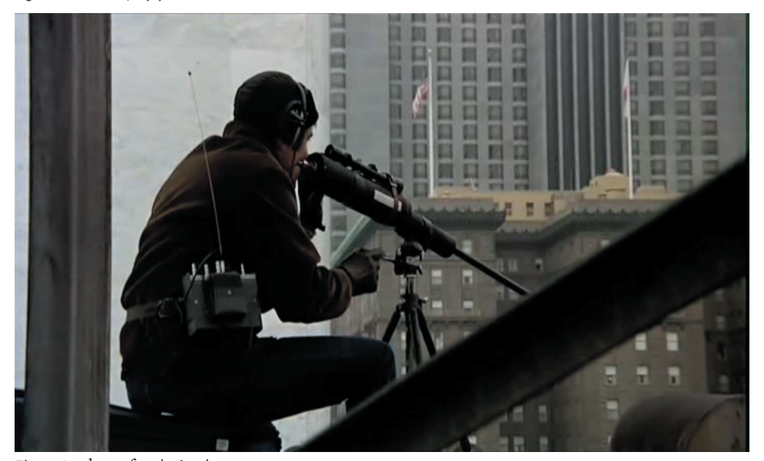
Figure 3 – the rooftop 'sniper'

We can apply several of the Peircean concepts under discussion to the opening minutes from The Conversation . Examples of icon, index and symbol, abduction, initial and dynamical objects and interpretants are all exhibited in order to create an intriguing and narratively inventive opening scene – the creative way the scene is constructed, the deliberate withholding of information and an implicit under-