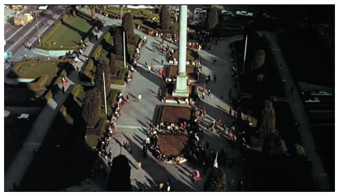
Figure 1 – opening shot of the city square